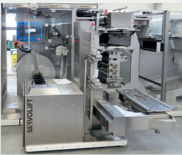
Exchange of modules/tools at a packaging line