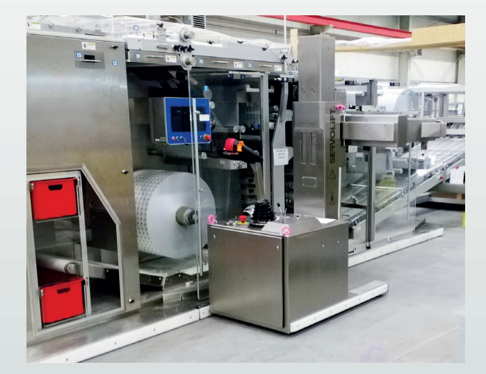
Sideways positioning at the packaging line for exchange of the foil reel